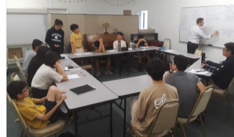
Last Day of Summer School